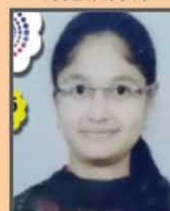
Y LEKHYA 189L1A05B6