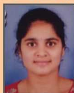
B VENI 189L1A0518