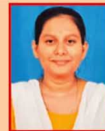
S MANASA 189L1A0477