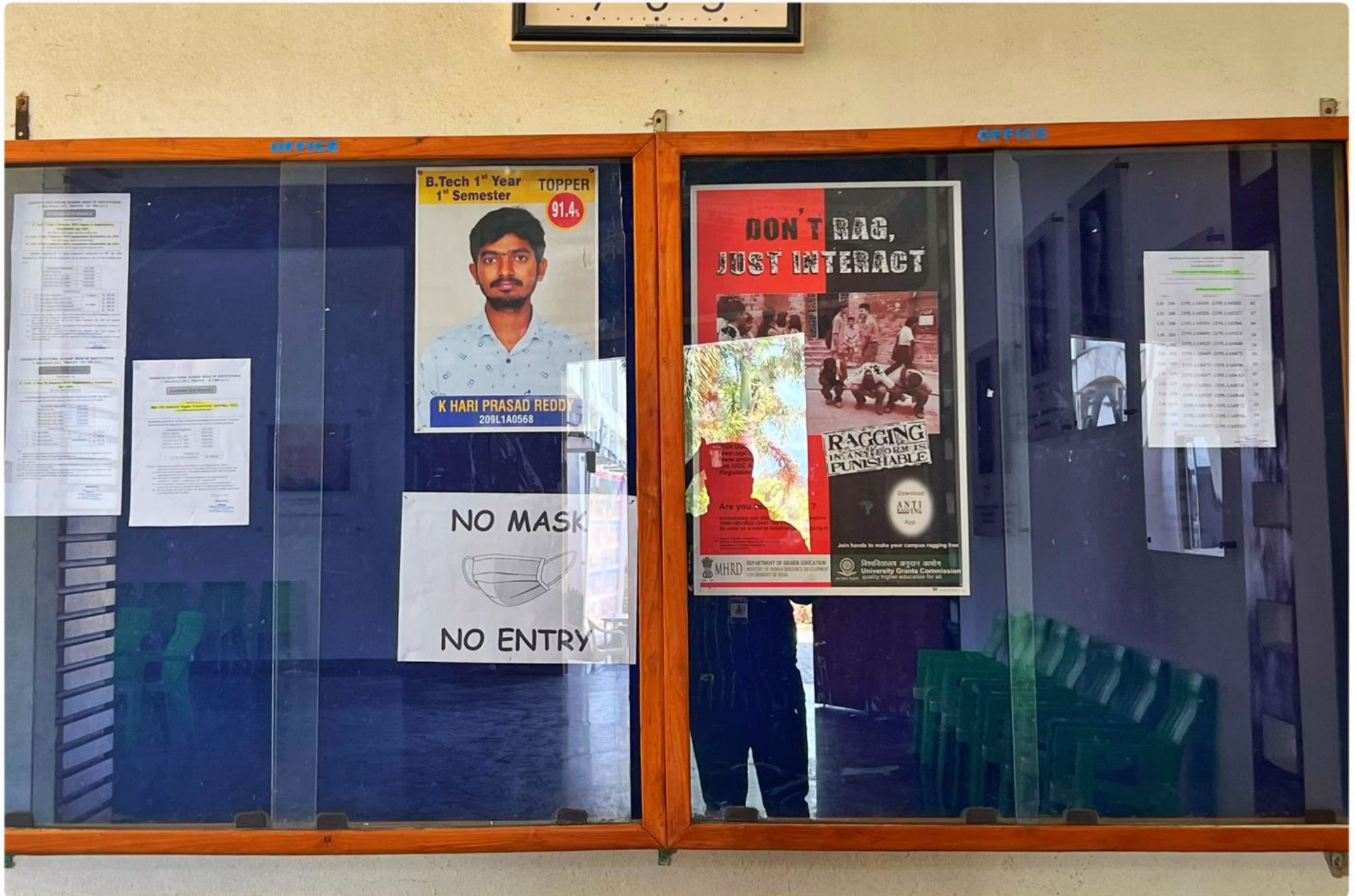
NOTICE BOARD - OFFICE @ SEAT