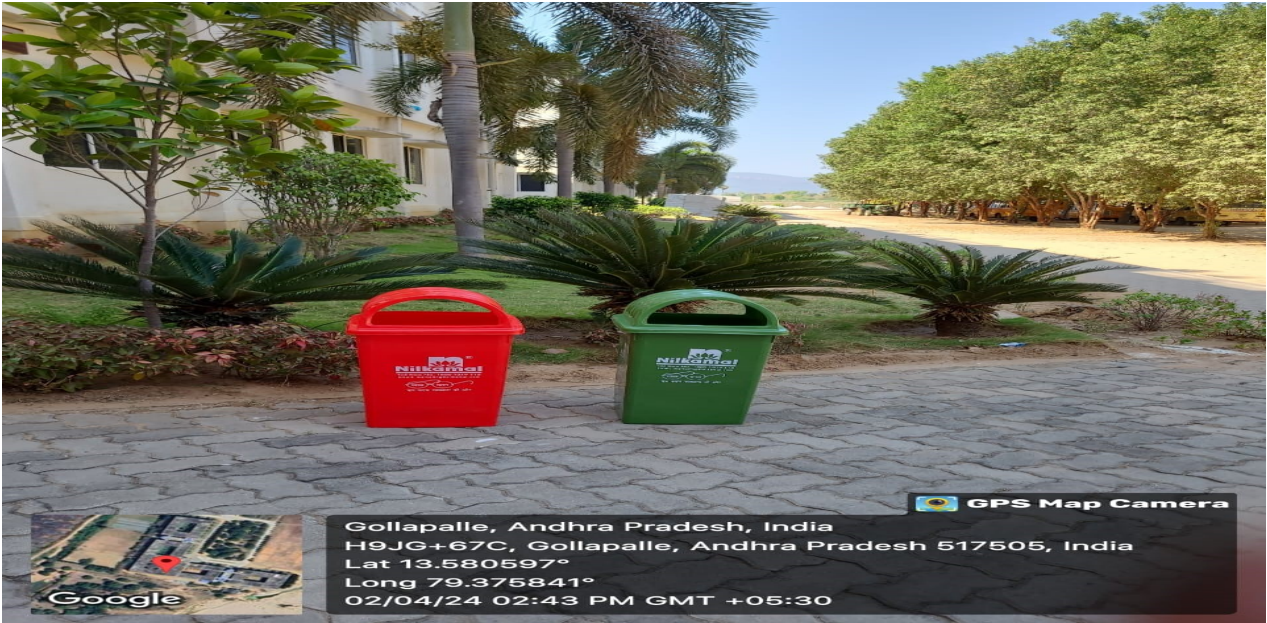
Dust bins along road side