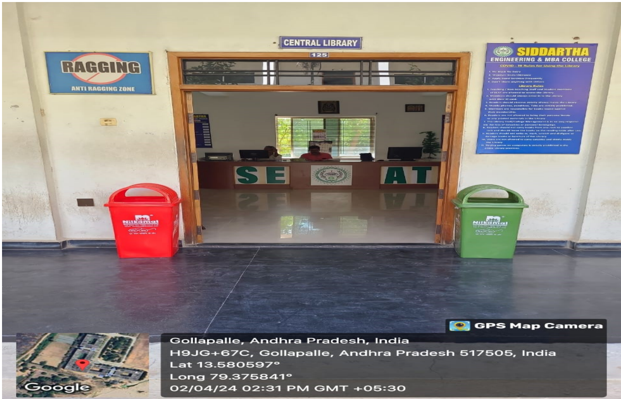
Dust bins at the Library Entrance