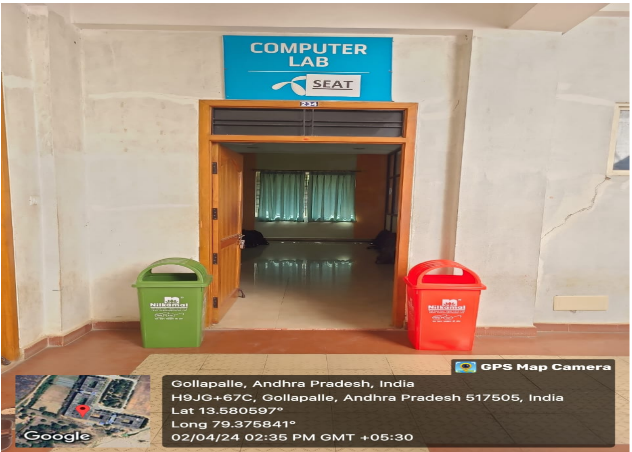
Dust bins at the Computer lab Main Entrance