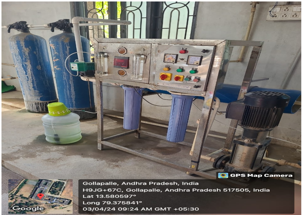
Reverse Osmosis (RO) System