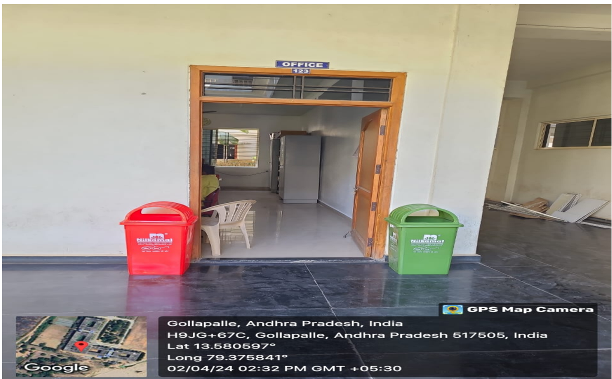
Dust bins at the office Entrance