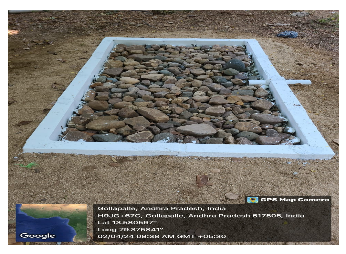
Rain Water Harvesting Pit – 4