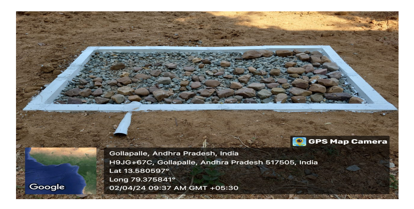
Rain Water Harvesting Pit - 3