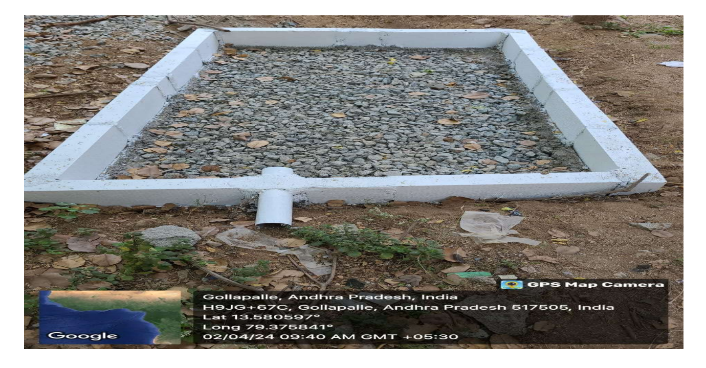
Rain Water Harvesting Pit -1