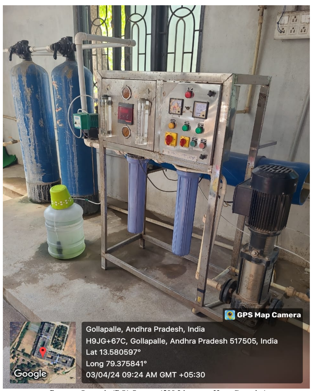
Reverse Osmosis (RO) System (500 Liters per Hour Capacity)