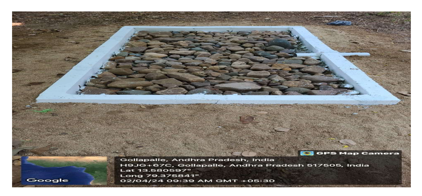
Rain Water Harvesting Pit – 2