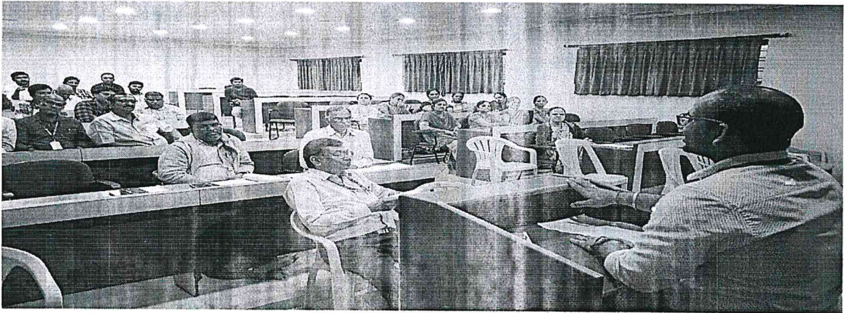
Faculty and Staff participating in the event